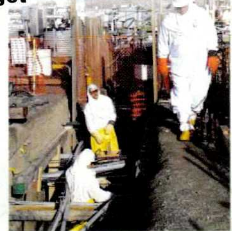
CH2M HILL Hanford Group employees worked to install the vitrification plant utilities and infrastructure in record time and under budget.

radioactive and chemical wastes from the production of plutonium for national defense. The waste will be retrieved from the aging tanks and incorporated into a stable glass form in large melters in the vitrification plant. Construction of the vitrification plant on Hanford's Central Plateau is scheduled to begin in 2002.